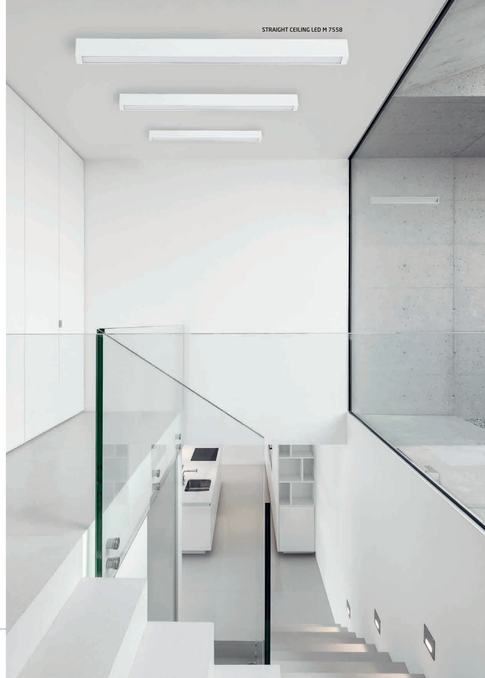
STRAIGHT CEILING LED M 7558

GRAPHITE P010 RAL 7016 WHITE P004 RAL 9003 BLACK P013 RAL 9005